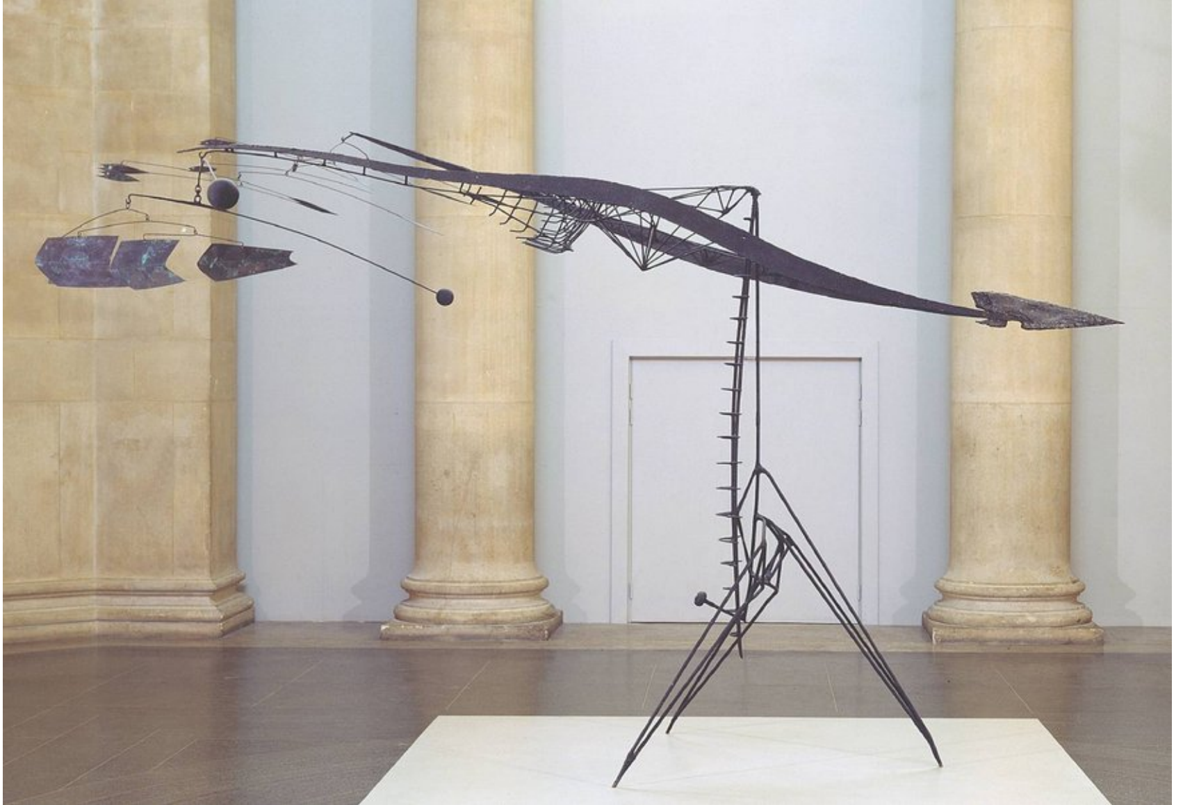
Figure Totem Beast: Sculpture in Britain in the 1950s @ Tate Britain

I think the central Duveen Galleries at Tate Britain are made for sculpture. Tate has currently filled them with a selection of post-war sculptures by some the British greats. Lynn Chadwick's rather sleek looking Fisheater contrasts with a solid reclining figure by Henry Moore. It's work people may have seen before, but given the space it needs to be fully appreciated. Until 4 February.