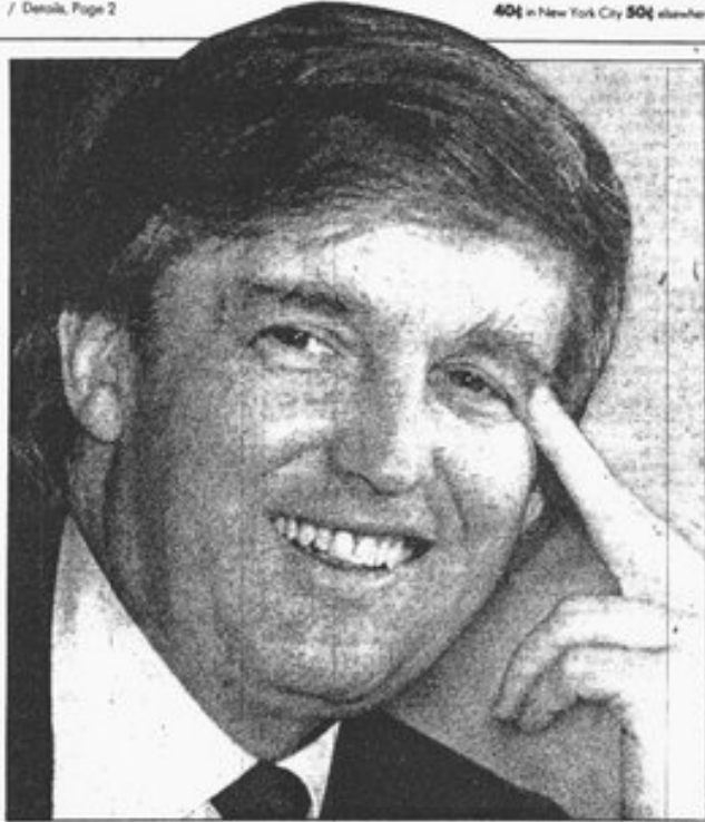
The Donald says he has a $5 plan that will keep Iron Mike in the ring.

Trump's weird megabuck deal to keep Tyson out of slammer