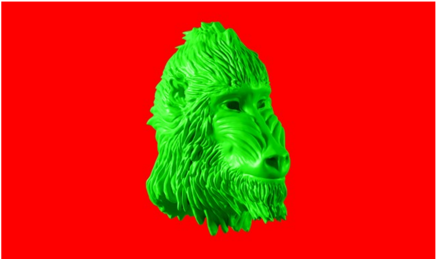
Brud. A Shrewdness of Apes