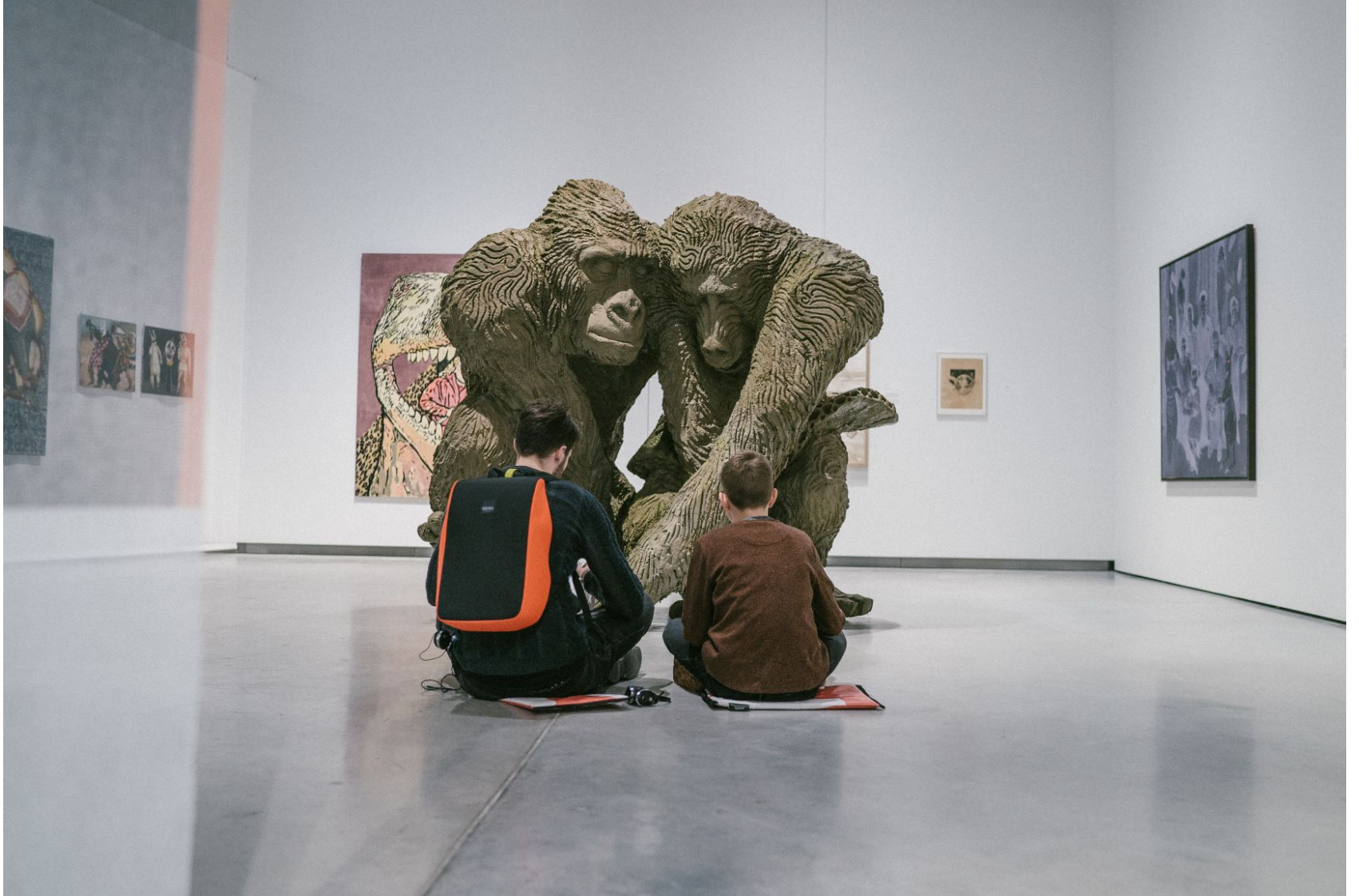
Animal - Human - Robot.