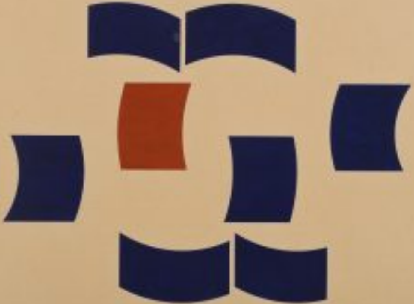
Hélio Oiticica, “Metaesquema” (1957)