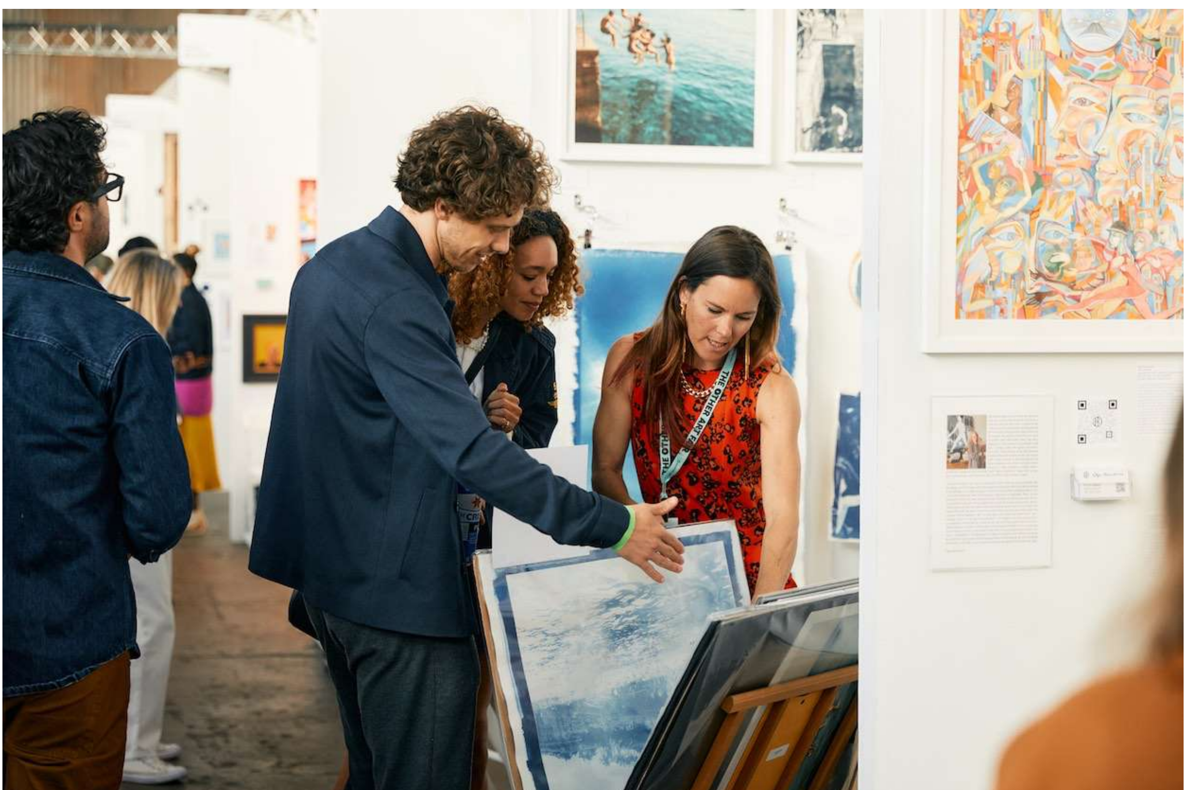
The Other Art Fair 2023.