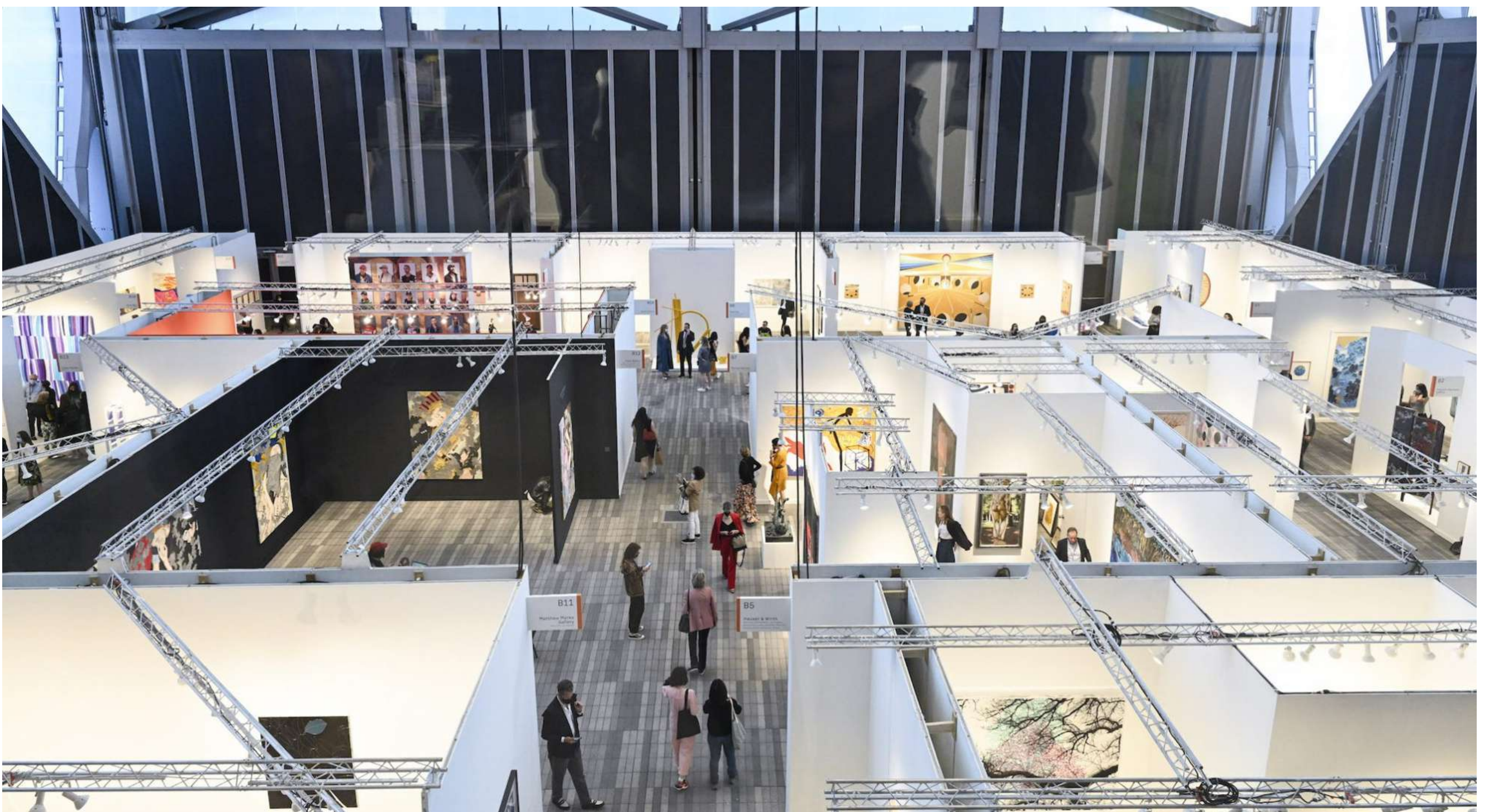
Frieze New York 2022 at The Shed at Hudson Yards.